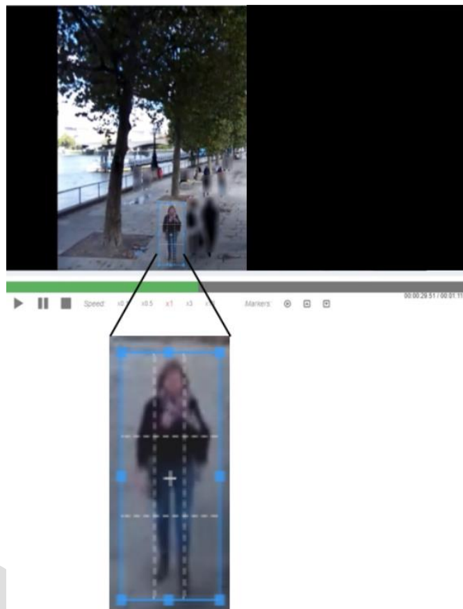
Figure 4: Example screenshot from the SFCT in which a bounding box has been selected around the target-actor depicted in Figure 1b using the TooManyEyes system (with enlarged image below). The functionality of some of the tools provided with the TooManyEyes system is also depicted. Often moving footage can provide more identification information than a single frame as depicted here.

This research demonstrated that the TooManyEyes system provides a suitable platform for the Spot the Face in the Crowd Test (SFCT), a different version of which has been employed to test police involved in CCTV review and other similar duties. As expected, consistent with previous research [15], police who have experience of working in a full time Metropolitan Police Service (MPS) CCTV review Super-Recogniser (SR) Unit, some of whom may possess exceptional face recognition ability, significantly outperformed police controls in terms of higher rates of correct identifications of target-actors depicted in the SFCT. SRs' confidence in correct identifications was also significantly higher than controls, again supporting predictions and in line with previous research [15]. However, probably due to low statistical power, from low participant numbers, no differences were found in rates of false bystander identifications (false positives) or correct rejections of empty clips, although the scores were in the expected direction.